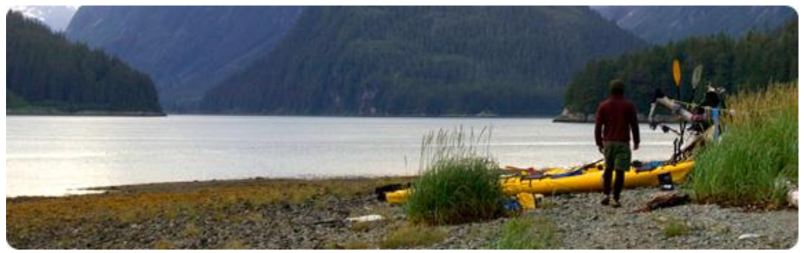
DAYS 2-4: West Arm, Glacier Bay

We'll be dropped off in the remote upper West Arm, where we'll unload gear and have a kayak lesson. By afternoon, everyone will feel comfortable enough with sea kayaking to fully observe the splendid beauty of this area. Lunch and dinner are included this day.